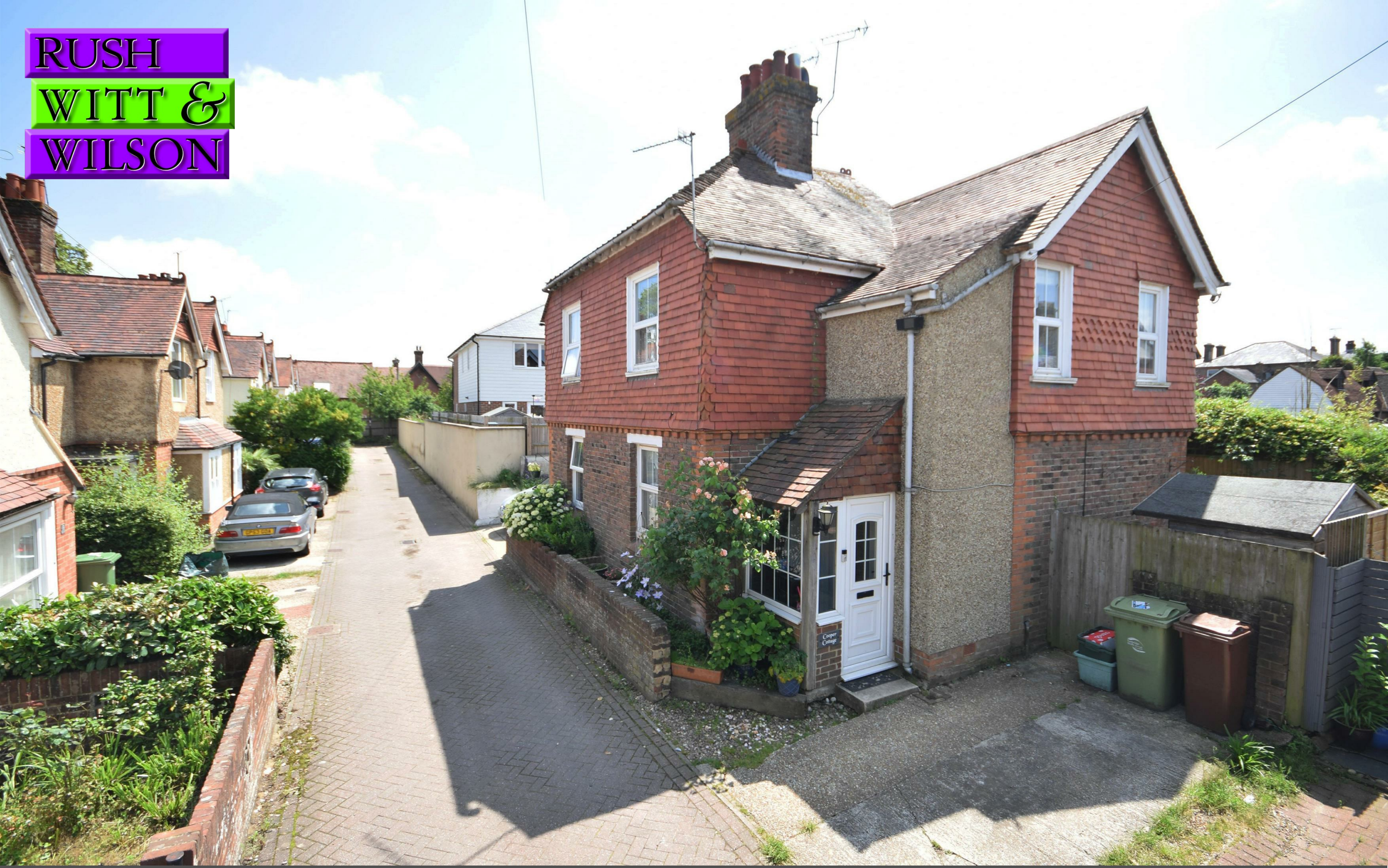
Cooper Cottage, Western Avenue, Hawkhurst, Kent, TN18 4BL. £300,000 OIEO Freehold